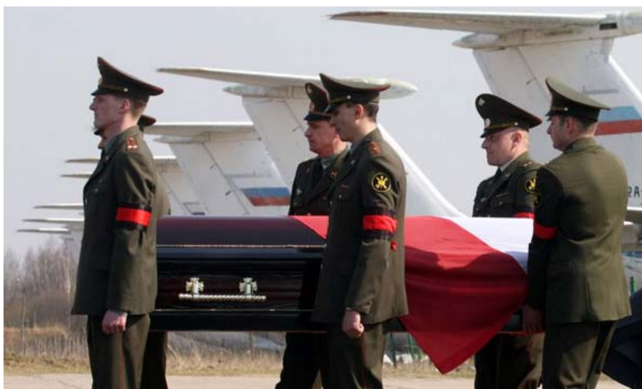
Soldiers carried flag-draped coffin of President Lech Kaczynski after arriving from Russia earlier this week